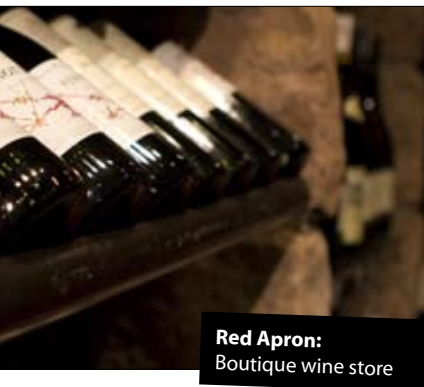
Red Apron: Boutique wine store