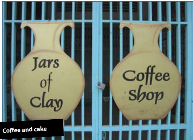
Coffee and cake