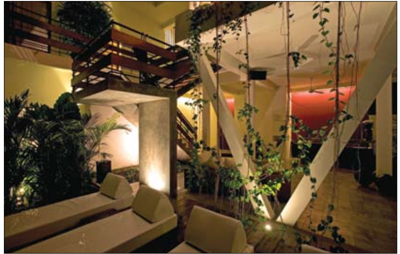
Viroth's boutique hotel New Khmer architecture meets contemporary style

dishes average US$7.50. Desserts range from US$3 to US$4.50. The restaurant itself is air-conditioned, small and cosy with bottles of wine lining the back wall creating the feel of a convivial French bistro.