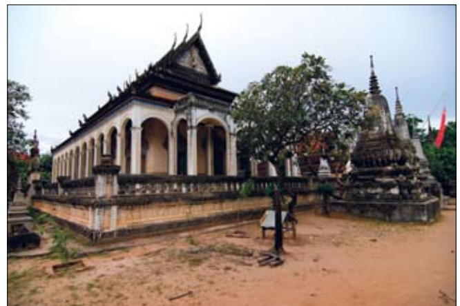
Wat Bo A tranquil temple to explore