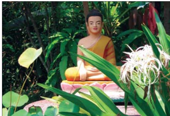
Singing Tree Meditate in the relaxing gardens

613 Wat Bo Road Tel: 012 894 207, www.orientalistes.com Quirky, colourful Les Orientalistes is a three-year-old French-run restaurant set in a Khmer wooden house, with some accommodation also available from US$40 a night. The menu features French dishes from grilled meats to coquilles saint jacques (US$9) and duck breast (US$10), to a tajine menu ranging from US$6 to US$8. There are