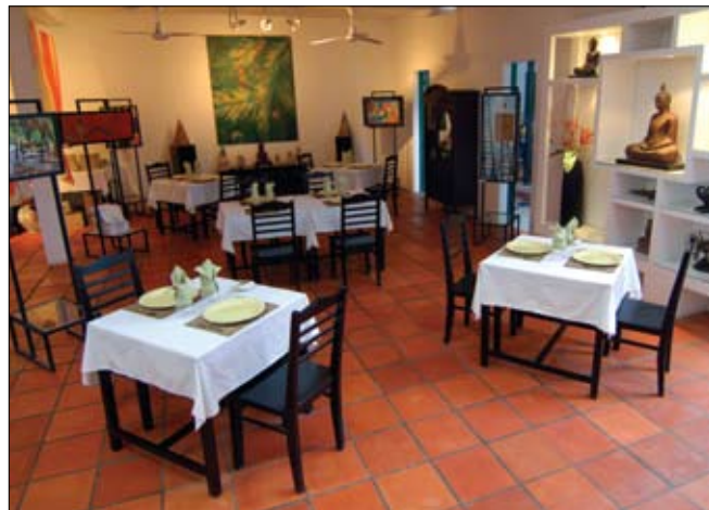
Alliance Cafe A sophisticated restaurant with art to boot

also Thai and Khmer influenced salads and curries (average US$5). Most of the restaurant's tables are covered, with a new patio out the front providing another option.